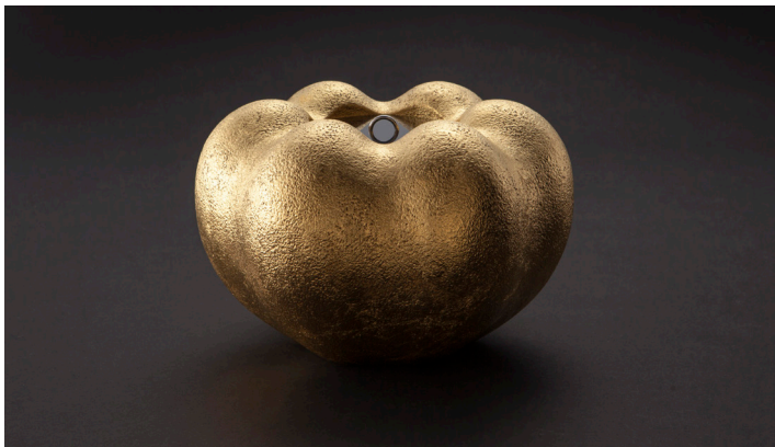
Jihei Murase, Gold Melon-Shaped Water Container 金彩阿古陀水指 (2025), Lacquer, H17 x φ26 cm (C28593)