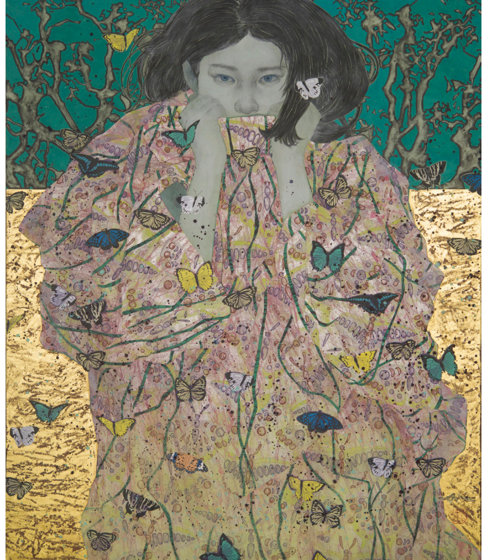
Kaori Someya, Singing for the Rocks (2025), Japanese paper, glue, gold leaf, platinum leaf, mineral pigments, dyes, H28 5/8 x W23 7/8 in, H72.2 x W60.6 cm (A28761)

The pure material, never to tarnish nor rust, is the object of fascination and admiration for more than a thousand years in Japan. Gold represents divinity, the eternal, and symbolizes spiritual enlightenment since ancient times, serving to cover statues of Buddha, temples like Kinkaku-ji in Kyoto, and the feudal lord Hideyoshi Toyotomi's famous Gold Tea Room. Under shadows the gold leaf adorned folding byōbu screen thrives; "in the darkness, where sunlight never penetrates, gold leaf will pick up a distant glimmer, then suddenly send forth an ethereal glow, a faint golden light like the horizon at sunset" (Jun'ichirō Tanizaki, In Praise of Shadows ).