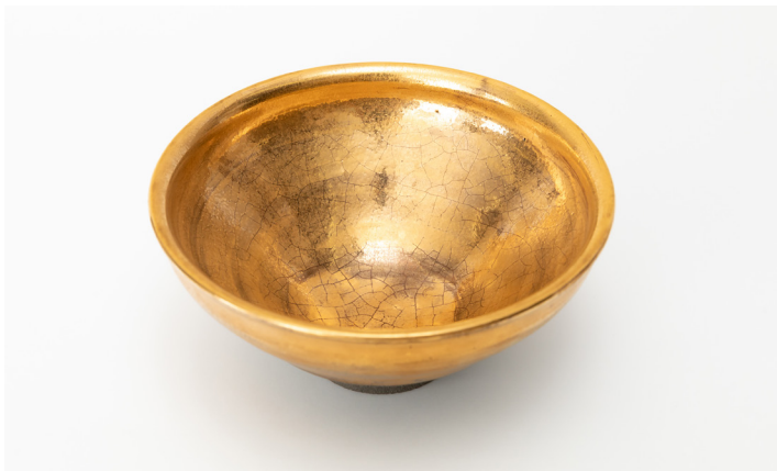
Noriyuki Furutani, Gold Tenmoku Tea Bowl 金天目茶盃 (2025), Ceramic, H2 3/8 x W4 3/4 in, H6 x W12 cm (C27854P)